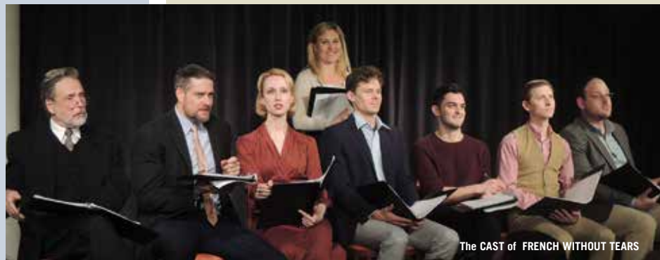
The CAST of FRENCH WITHOUT TEARS