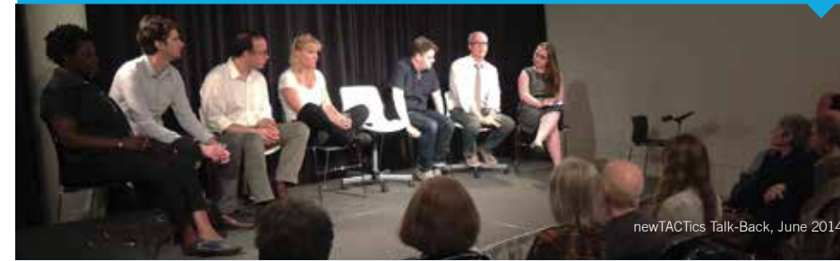
newTACTics Talk-Back, June 2014

newTACTics' 4th Annual New Play Festival returned in June, with four premieres of contemporary works-in-development. Each week, a new play underwent a concentrated rehearsal process to closely examine the text before it received two public presentations at the TACT Studio.